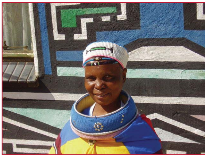
The Mapog Village outside of Pretoria forms part of the Cultural Awakening tours

As an in- and outbound tour operator, Kwathlano offers national tourism related services, such as countrywide car rental, Cultural Awakening tours, transfers and chauffeur drive with offices in Pretoria, Johannesburg and Cape Town.